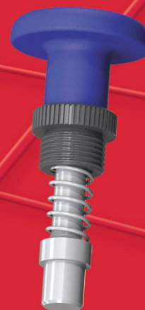
1/2" Short Tip