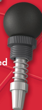
1/2" Tapered Tip