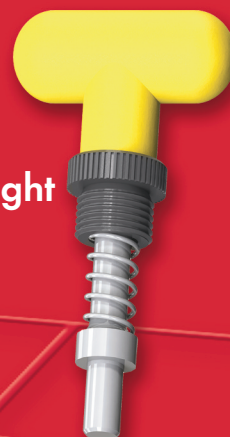
3/8" Straight Tip