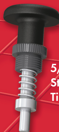
5/16" Straight Tip