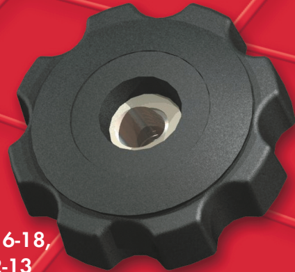
F6 1/4-20, 5/16-18, 3/8-16, 1/2-13