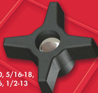
4P7 1/4-20, 5/16-18, 3/8-16, 1/2-13