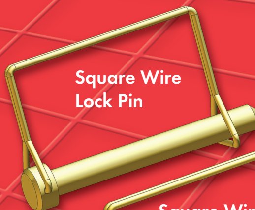
Square Wire Lock Pin