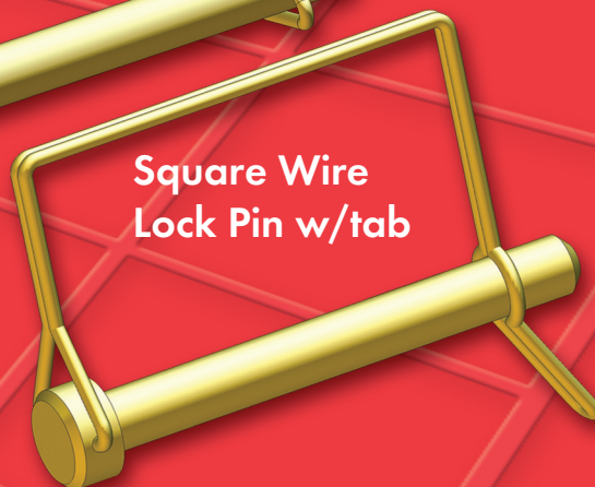
Square Wire Lock Pin w/tab